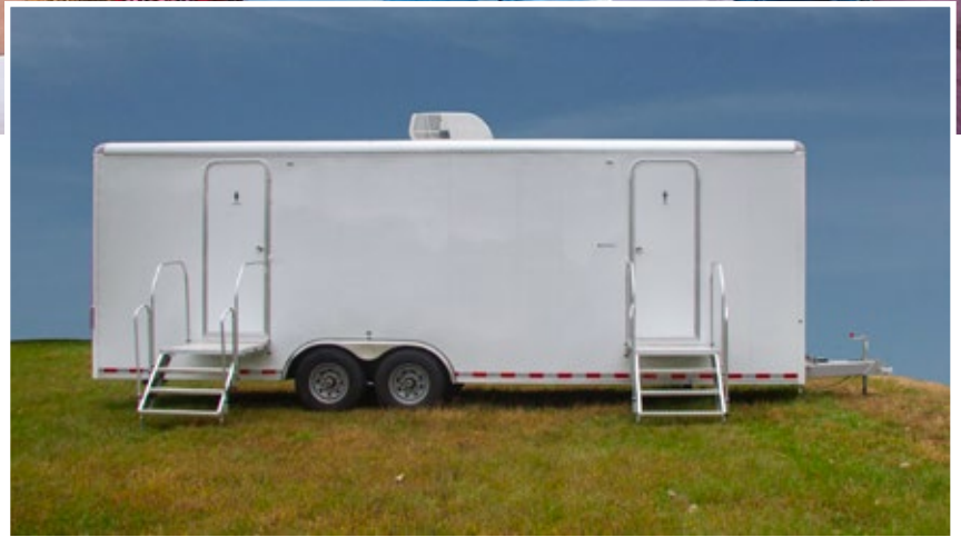
Trailers may feature optional equipment available at an additional charge.

Meet the new standard for all your high capacity functions. These multi-stall restrooms will comfortably accommodate 10+ individuals at one time. Spacious and durable elegance in a mobile restroom trailer with easy hook-up has never looked better.